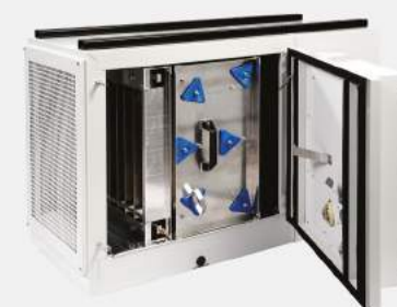
Main filter consisting of ioniser and collector